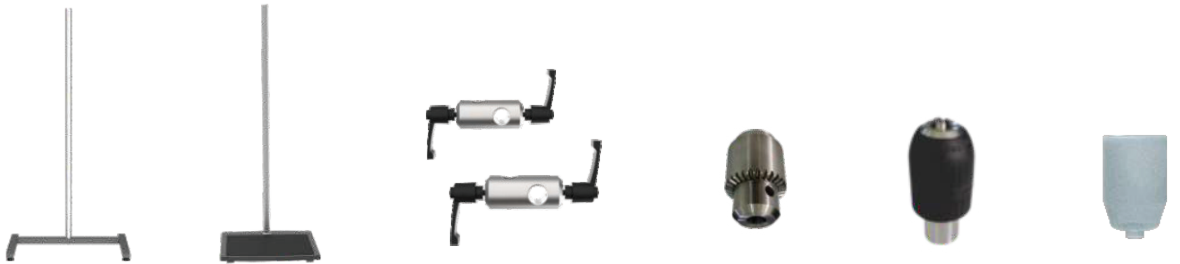
Only H-stand Plate Stand Boss Head Clamp Key Chuck Keyless Chuck Chuck Cover