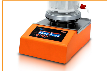
Controlled Heater Setup