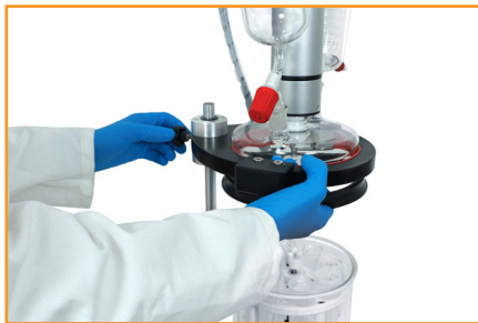
Non - Pressurized system for user safety