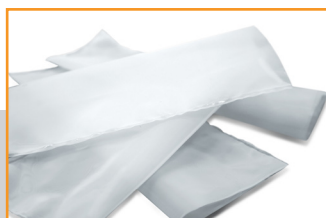
Fiber Bag BLAAMFB008CRC0000