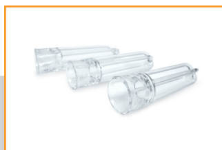
Glass spacer BLAAMFB0081000004