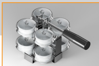
Silica Crucible with Tray BLAAMFB008CRCLIDAC