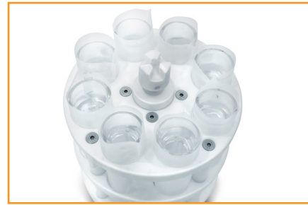
Drop in coupling to ensure perfect head to base fit