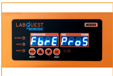
Buzzer alert upon process completion