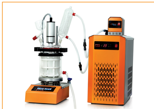
CHL050- 5ltr chiller for fiber unit