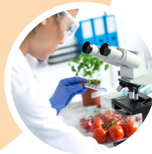
Food Technology Institutes