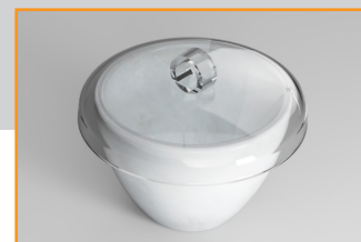
Silica Crucible BLAAMFB008CRULIDAC