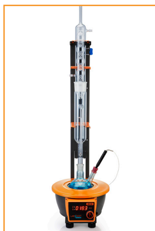
SOX015 ( one position 500ml soxhlet) Also available in 6 position and 250ml capacity

Samples to be defatted before subjecting to fiber estimation. A soxhlet apparatus to be used for removing the fat content of the sample. Optimum results guaranteed with a Chiller