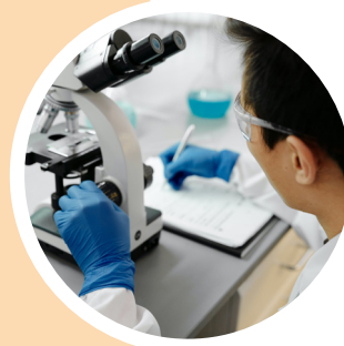
Research & Academic Institute