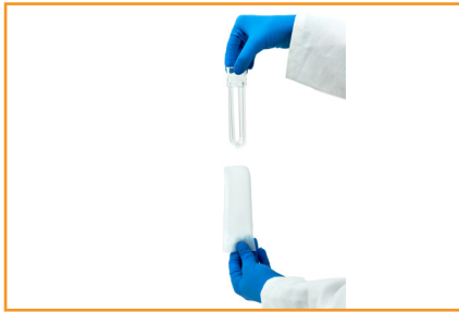
Fiber bag spacer method to increase throughput