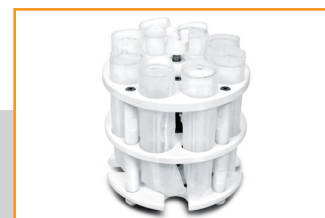
Insert rack (carousel) BLARMFB0081100000