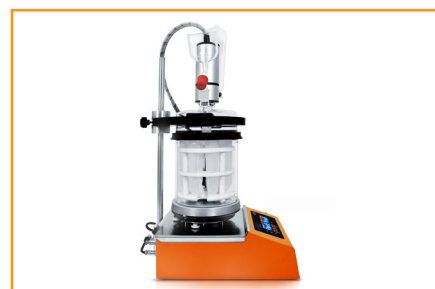
Compact design reduces bench space