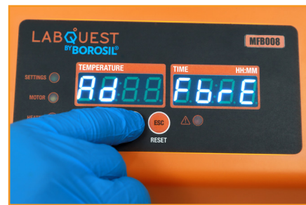
User-friendly interface with display prompts for process navigation